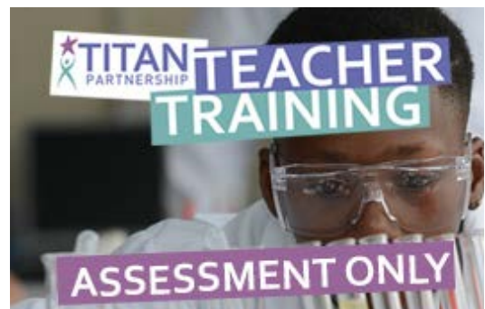
Teacher Training - Assessment Only Route 10% Discount