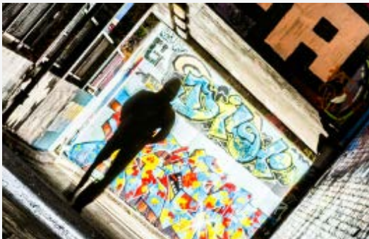
UCB L3 Working with Gangs Programme