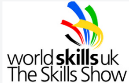
Skills Show Exciting Opportunity