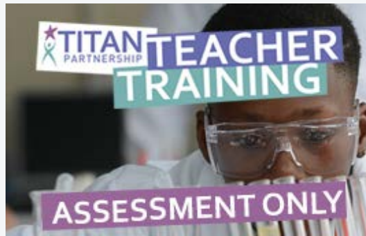
Teacher Training - Assessment Only Route 10% Discount