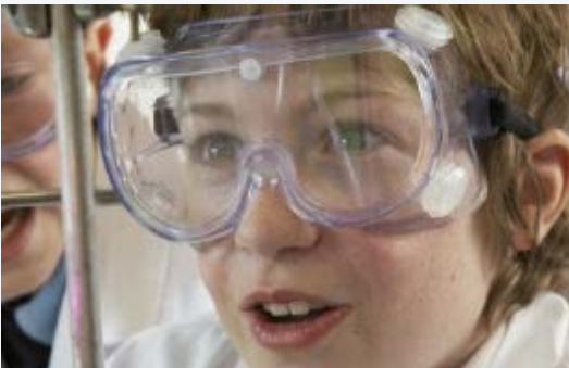
AUEA Primary STEM Events Exciting Opportunity