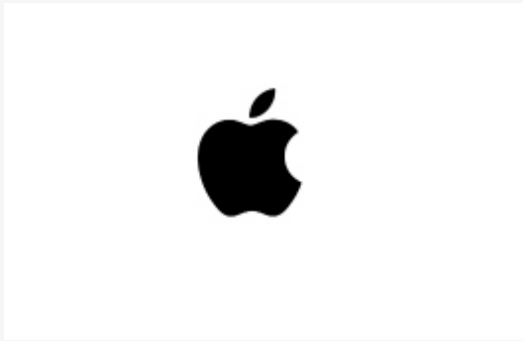
Apple RTC – FREE iPad Training Sessions