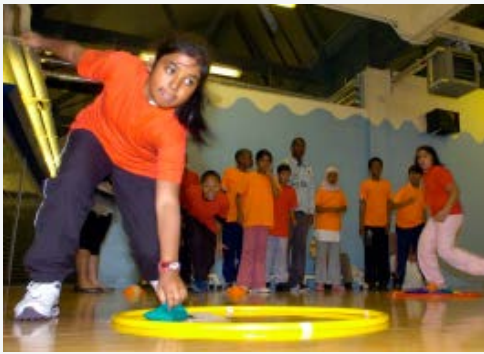
Register for Aston Olympians 2017 FREE to Take Part